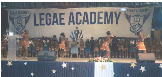
Setswana Traditional dance