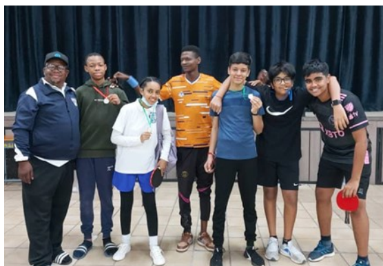
Table Tennis team