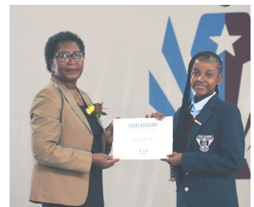
An Award winner