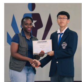
A moment of pride