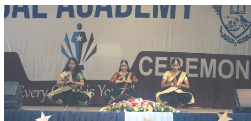
Indian Cultural dance