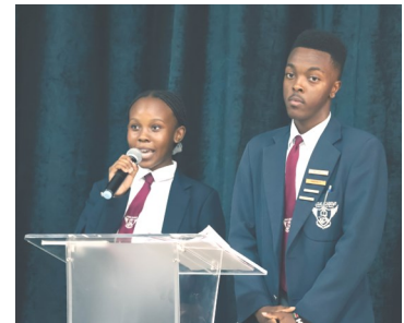
Head boy and Head girl